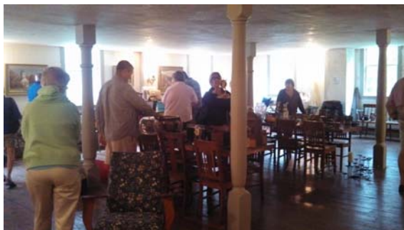
Lots of bargain shoppers at 8 AM

Many great donations were made for the Tag Sale, and there was a large crowd waiting for the doors to open at 8AM. The Tag Sale took place on Saturday August 24 from 8AM to 2PM.